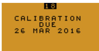
Configurable calibration options