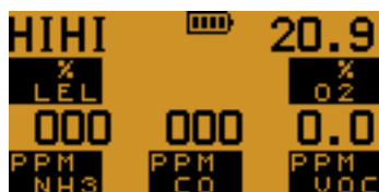
Display in alarm conditions